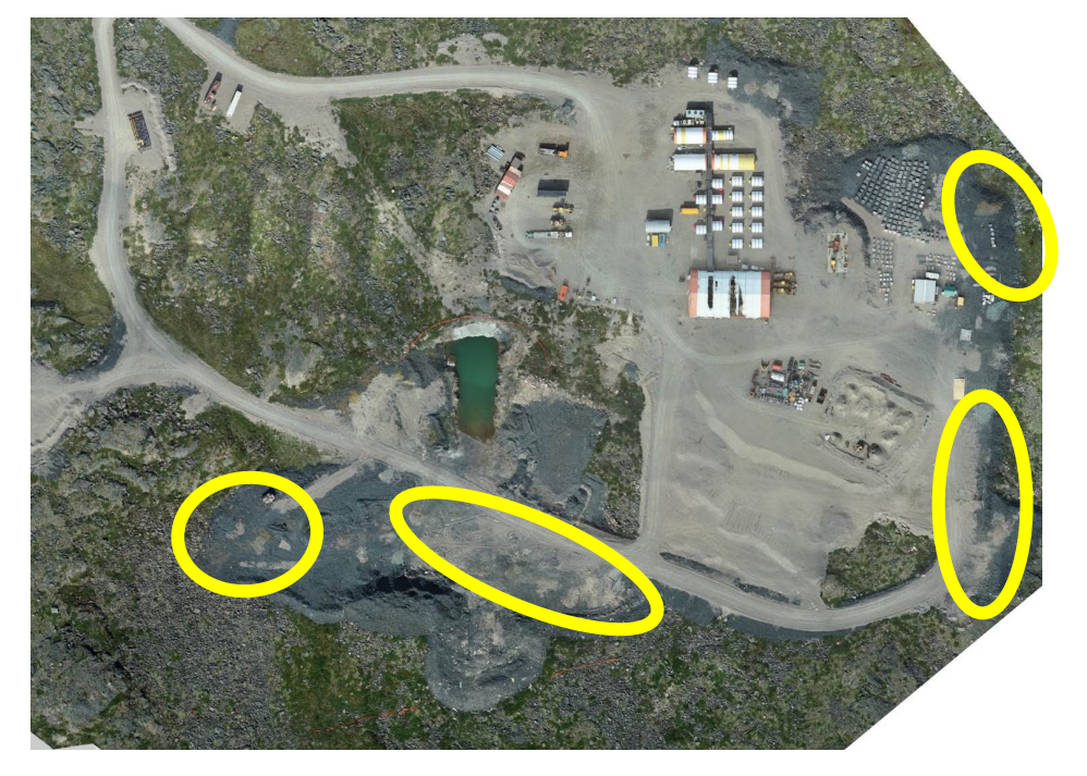
Before (2021) After (Sept. 2023)